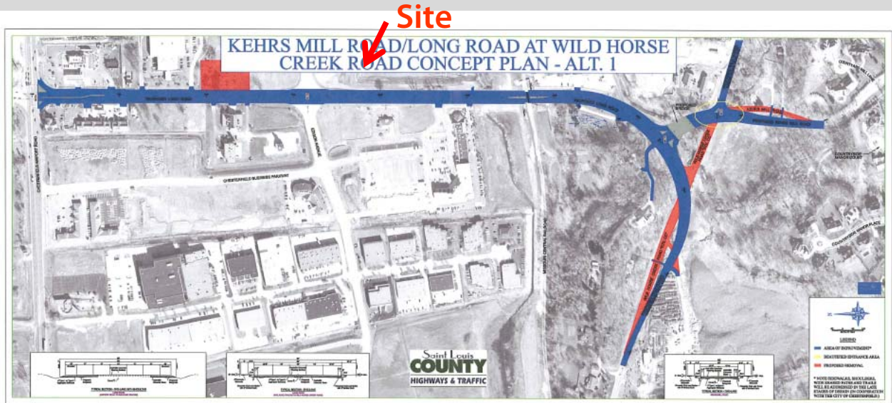
Long Road widening plan · St. Louis County Highway & Traffic · Under Construction Now